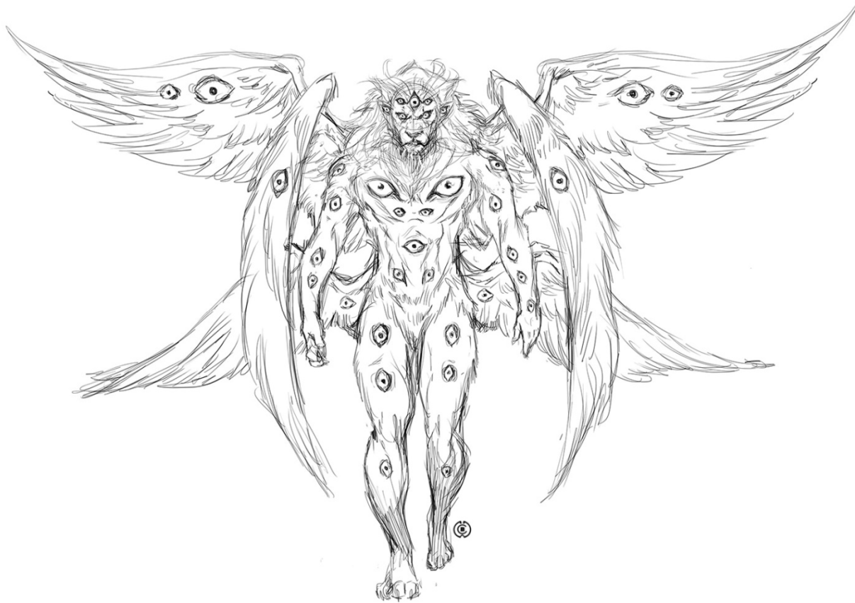
An artists' concept of the seraphim with the appearance of a lion.

This indicates a storm is headed to earth. That storm will be God’s judgment, which is described in subsequent chapters of Revelation. That judgment has nothing to do with the Redeemed saints of God who will be safely home in Heaven with God when the judgment comes. Oh, how vital that each of us is right with God and covered by the precious blood of Jesus!